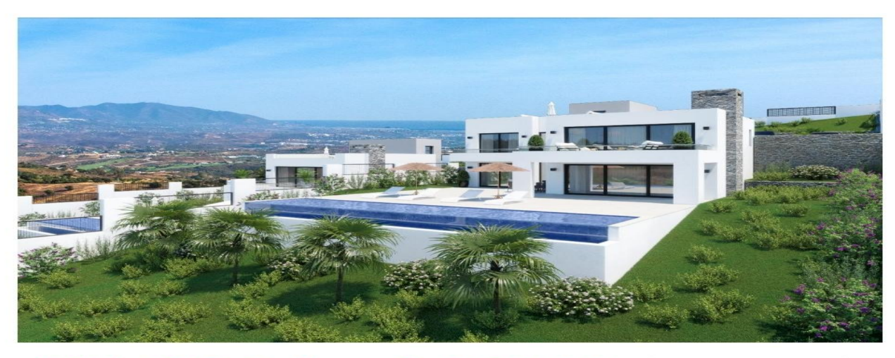
Villa609 Price: 1,450,000 (finished) 3 bedrooms | 421m2 built | 100m2 terraces | Plot

Referentie: RS17762 Slaapkamers: 3 Badkamers: 3 Perceelgrootte: 412m<sup>2</sup>