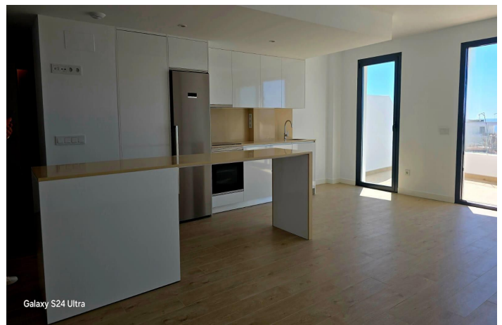
Galaxy S24 Ultra