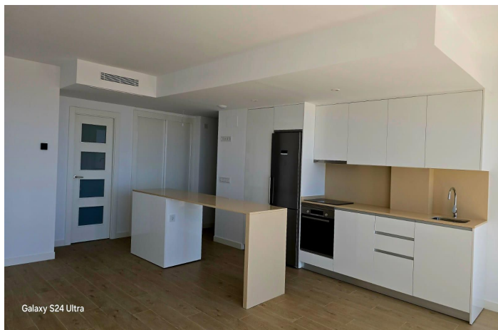
Galaxy S24 Ultra