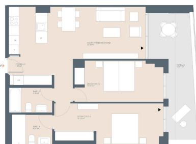
Bloque 2 Portal 3 P00-F