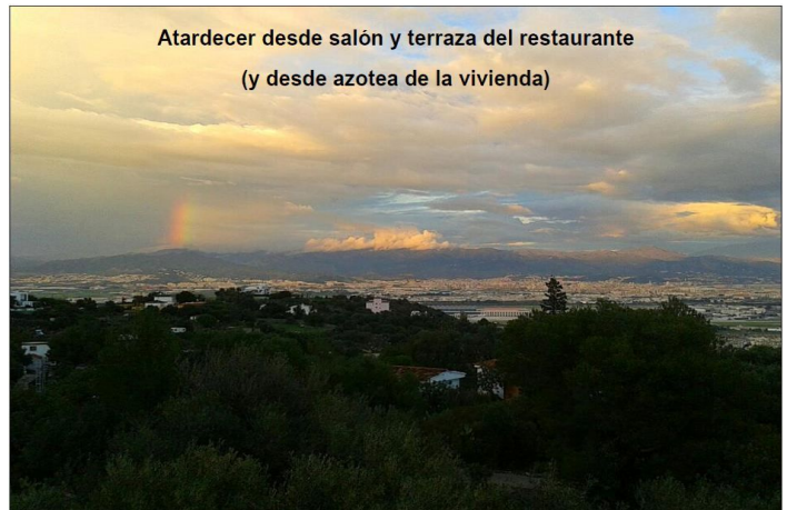
Atardecer desde salón y terraza del restaurante (y desde azotea de la vivienda)