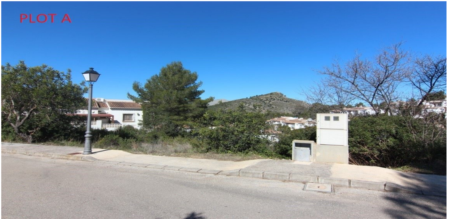
URBANIZATION PUERTA DEL VALLE. MURLA