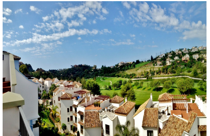
90 sq. mtrs. of rooftop solarium